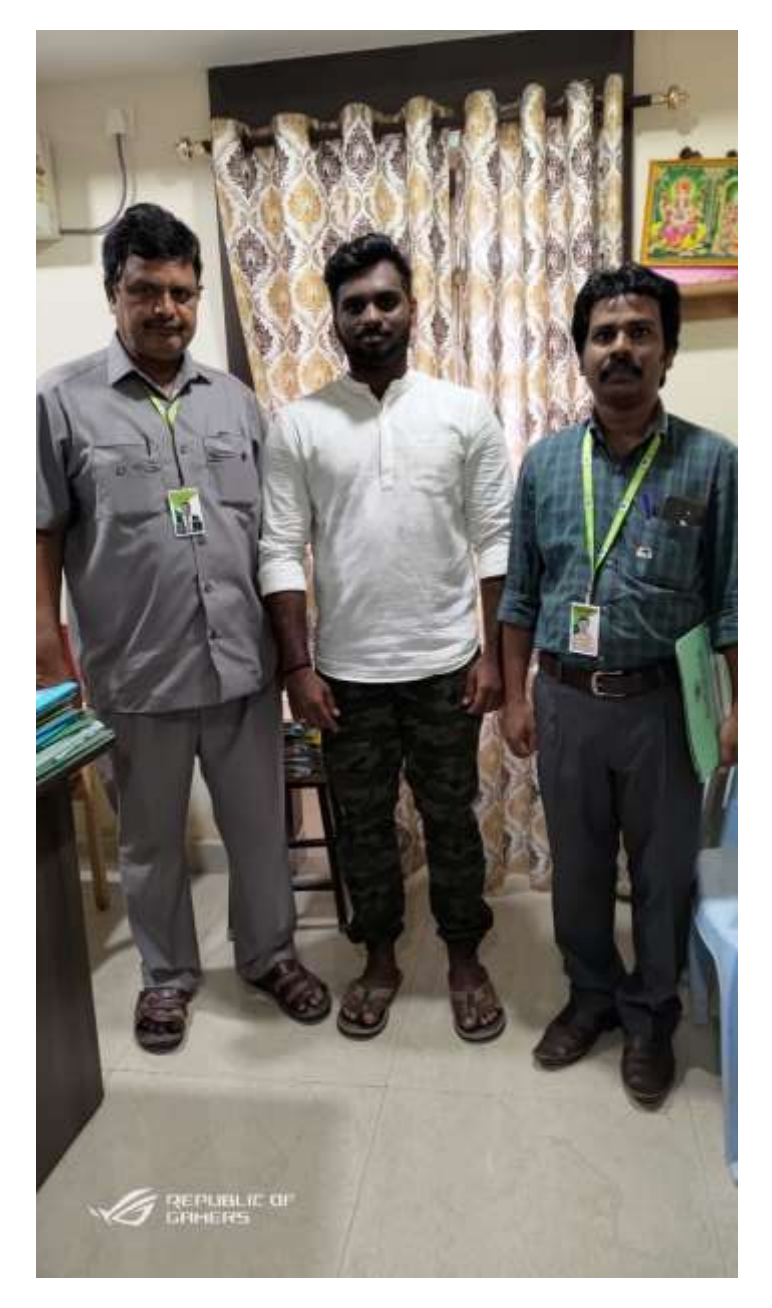
HOD – Alumni - Alumni-I/C