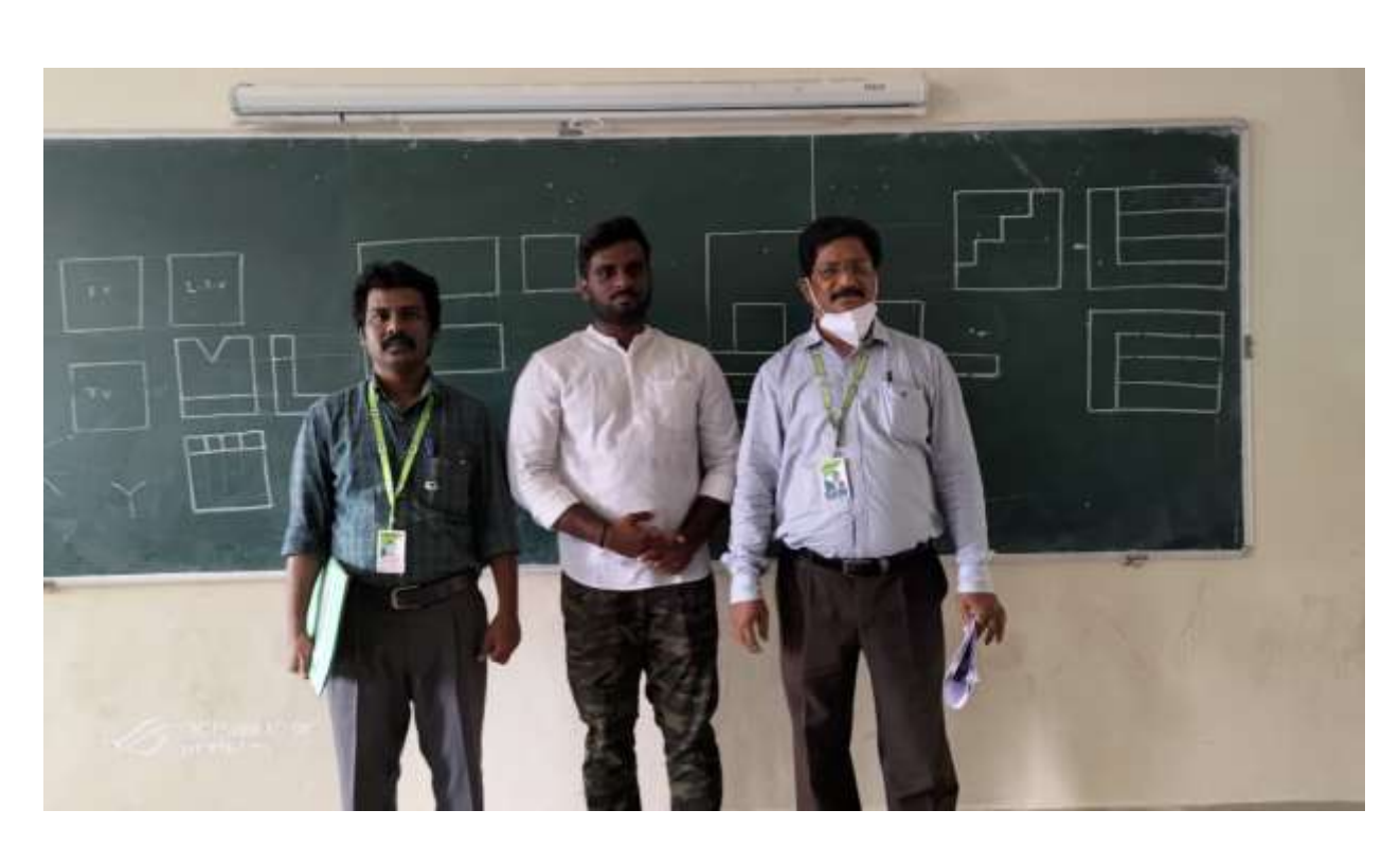
Alumni-I/C - Alumni - Staff